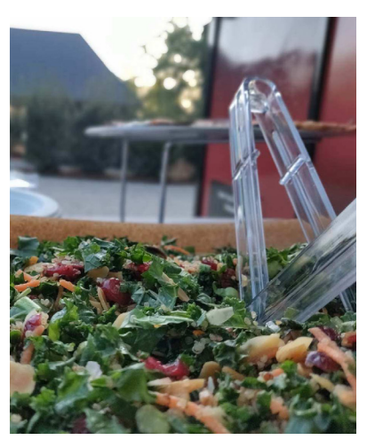
KALE / QUINOA SALAD