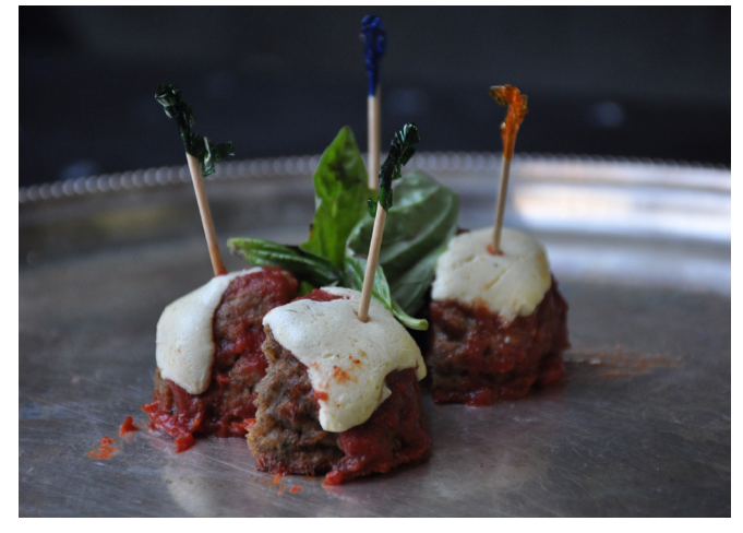
MEATBALLS / MARINARA