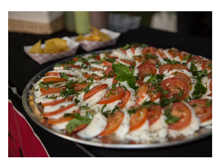
TOMATO / MOZZERELLA PLATTER