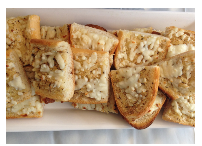
CHEESY GARLIC BREAD WITH MARINARA DIPPING SAUCE