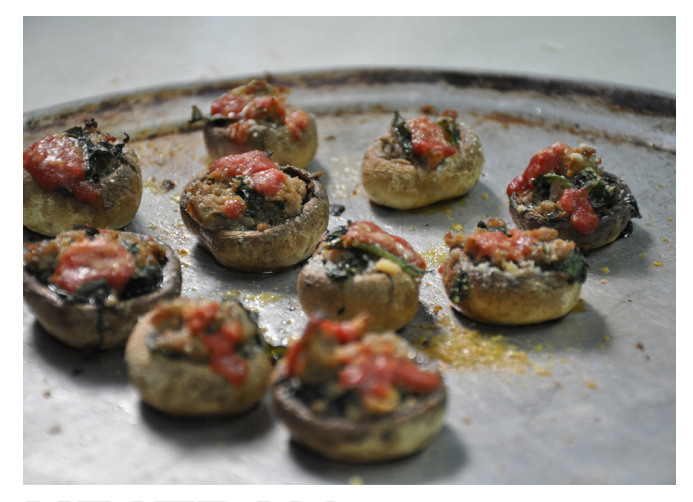
MEATBALL STUFFED MUSHROOMS