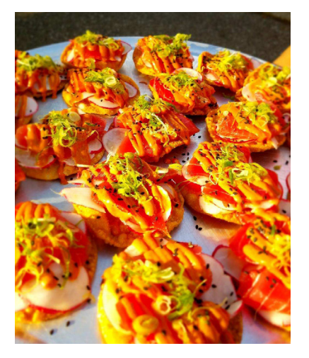
SPICY TUNA TOSTADA