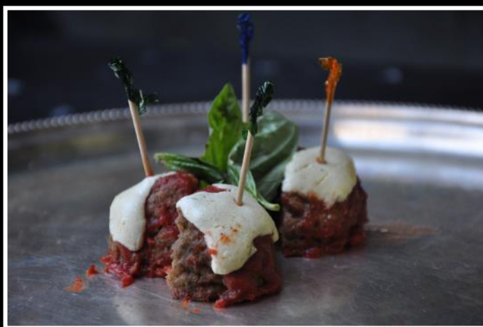
Meatballs & Marinara