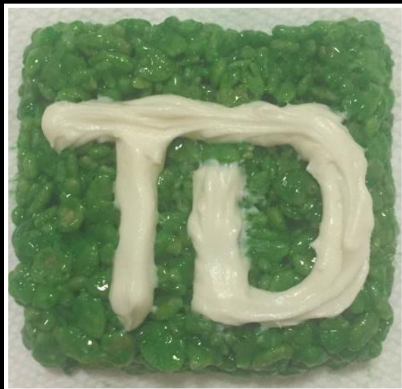
Custom Rice Krispie Treat