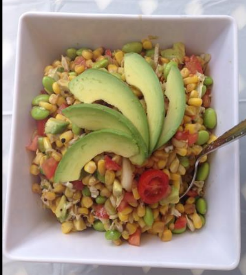
Fresh Corn Salad